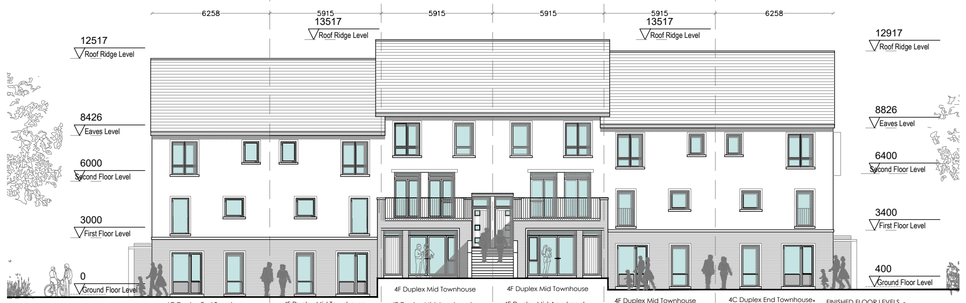
South Western Elevation SCALE 1:200 @ A3

* FINISHED FLOOR LEVELS - REFER TO SITE LAYOUT PLAN