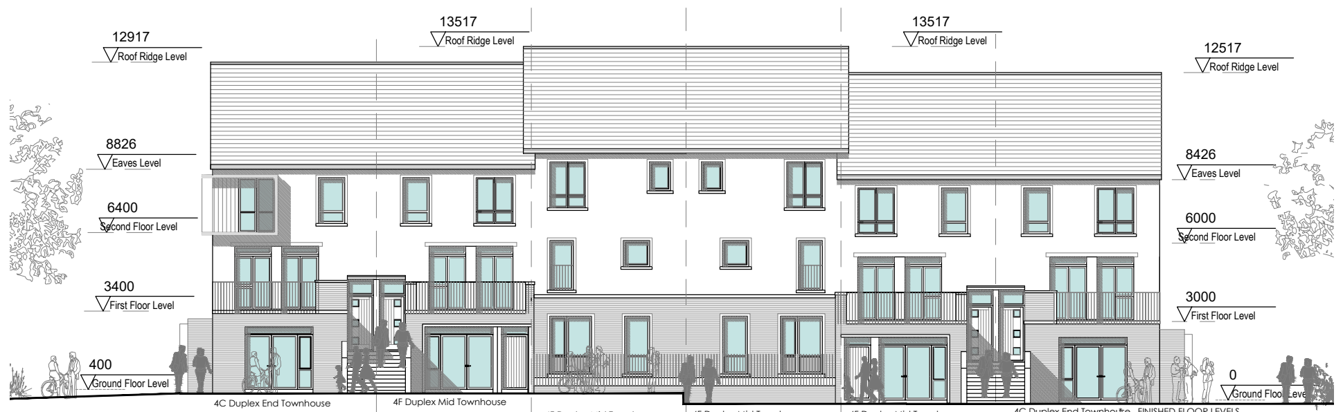
North West Elevation SCALE 1:200 @ A3

* FINISHED FLOOR LEVELS - REFER TO SITE LAYOUT PLAN